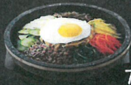
7 비빔밥 $15 or 돌솥비빔밥 $16 (in hot pot) Boiled Rice W Assorted Mixture