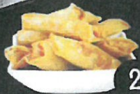
2 스프링롤 (5pcs) $8 Spring Roll