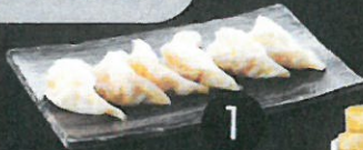
1 치킨교자 (6pcs) $8 Japanese Style chicken Dumpling