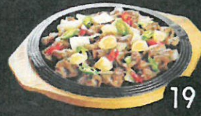
19 닭동집볶음 $18 Stir-fried Chicken Giblets W Veg