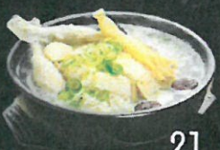
21 삼계탕 $25 Traditional ginseng Chicken Soup