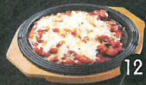
12 치즈불닭정식 $17 Hot and Spicy Chicken W cheese