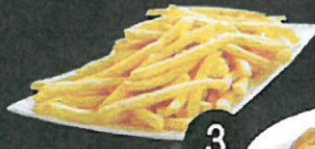
3 감자튀김 M $5 / L $7 Chips