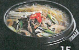
15 뚝배기 불고기 $15 Bulgogi Stew W Veg and Potato noodle