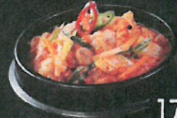
17 김치찌개 $16 Kimchi Stew W Pork and Veg