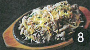
8 옛날 불고기 정식 $16 Thin Slice of Beef Marinated in the Special Soy Sauce