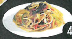
4 소고기잡채 $12 Stir-fried Potato Noodle W Veg and Beef