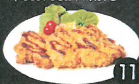
11 치킨까스정식 $17 Japanese Panko Crumbed Chicken W Special Sauce & Sour Cream