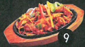
9 제육정식 $17 Spicy Stir-Fried Pork W Veg