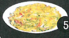
5 해물파전 $15 Combination Seafood Pancake