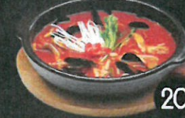
20 짬뽕탕 $25 Spicy Seafood Soup