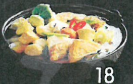
18 오뎅탕 $20 Fried Fish Cake Soup