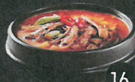
16 육개장 $15 Spicy Beef Soup W veg and Potato noodle, egg