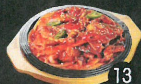
13 오삼정식 $18 Spicy Stir-fried Pork and Squid