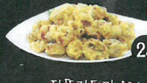
24 닭동집튀김 $20 Deep-fried Chicken Giblets