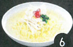
6 치킨라면정식 $10 Japanese style Chicken Ramen noodle Soup

LUNCH SPECIAL $13 NO.7 ~ NO.17 PM 12:00 ~ PM 03:00