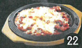
22 치즈불닭 $25 Hot and Spicy Chicken W cheese