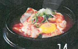
14 해물순두부 $16 Spicy Seafood and soft Tofu Soup W veg and egg